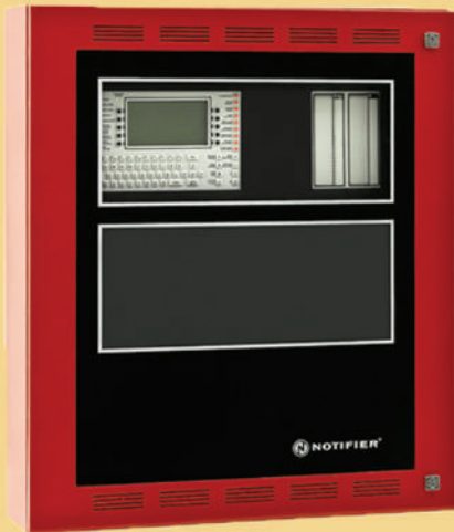
Conventional & Addressable Fire Alarm Panels

At Hart Engineering, we provide expert servicing for essential fire protection systems, ensuring they function reliably when needed most. We service and maintain dry systems such as Conventional and Addressable Fire Alarm Panels, Public Address Systems, VESDA Systems, Exit and Emergency Lights, Firemen Intercoms, and PWD (Persons with Disabilities) emergency communication systems.