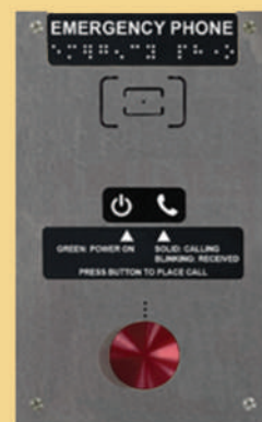
PWD emergency communication button