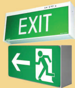
Exit/ Emergency Light