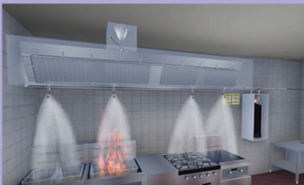
Kitchen Fire Suppression System