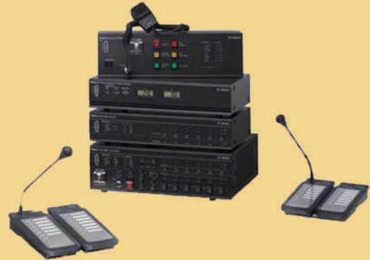
Public Address System