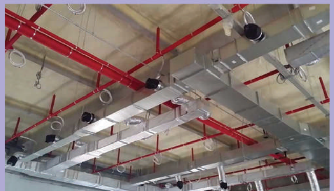
Engineered Smoke Control System + Smoke Control System